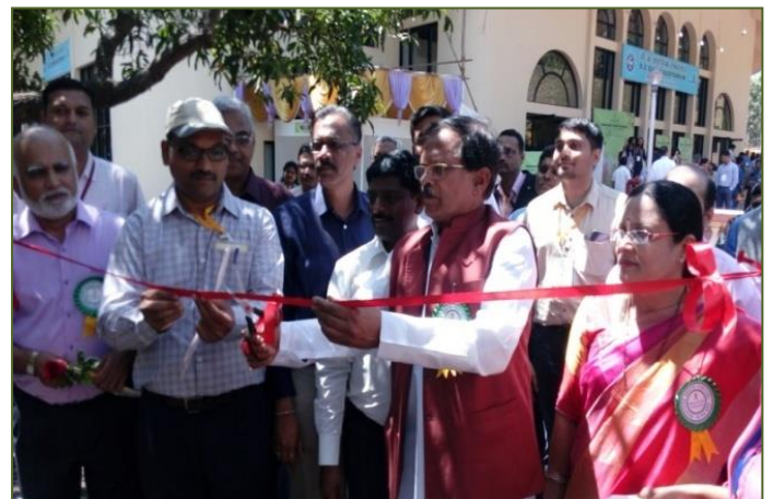
Glimpses of Hon'ble Minister of State (IC), Ministry of AYUSH, Shri Shripad Yesso Naik inaugurating "Global Agricultural Festival 2019" and (Right) "Ayurveda Youth Festival 2019"

✚ Regional Ayurveda Institute for Fundamental Research, Pune on the behalf of the Council participated in "Global Agricultural Festival 2019", held at Dongre ground, Nashik, Maharashtra, organized by Shri Swami Samarth Krishi Vikas V Sanshodhan Charitable Trust, Nashik during 25 th to 29 th January 2019 During the event display stall was arranged for the visitors in which Council's Publications and Council's Activities were displayed.