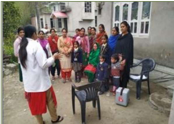
Awareness lecture on Importance of Nutritional food during Pregnancy and Lactation and Role of Nutritional food in Immunity during Poshan Pakhwada at RARIND, Mandi