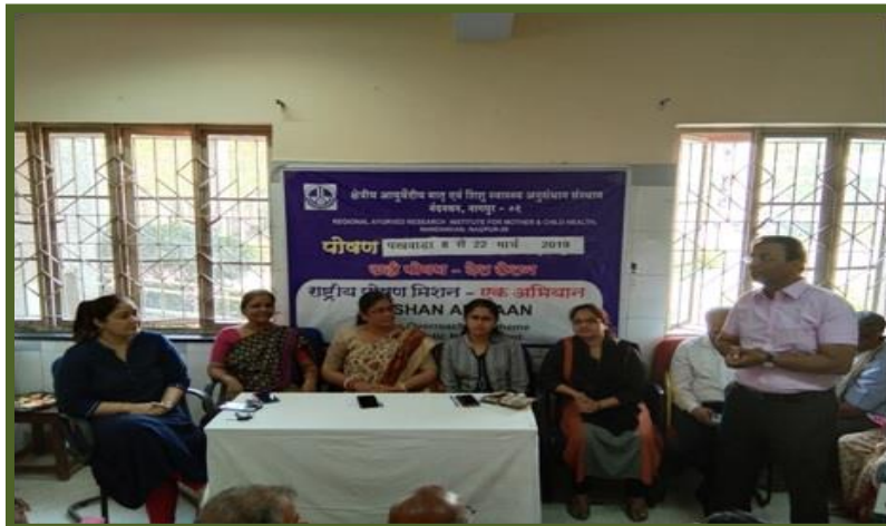
Lecture on Ayurvedic pathya apathya vivechana , Importance of nutrition in mother and child at RARIMCH, Nagpur

On the occasion of first anniversary of National Nutrition Mission “Poshan Pakhwada” was celebrated from 8 th to 22 nd March 2019 in all the peripheral institutes of the Council. Under this programme, various public lectures/classes regarding the importance of healthy, nutritious diet for all age groups with special focus on infant and child nutrition were organized within the Institute and in the periphery through outreach programs. Reports were received from RARIMCH, Nagpur; RARIMD, Bengaluru; RARILSD, Thiruvananthapuram; RARISD, Vijayawada; RARIND, Mandi; NARIP, Cheruthuruthy; MSRARIED, Jaipur, NIIMH, Hyderabad; CARIRD, Patiala etc.