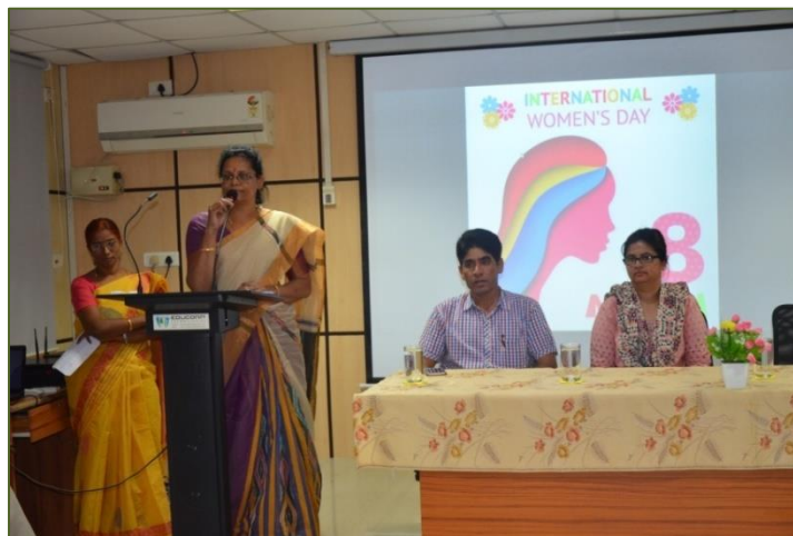
Glimpse of International Women's Day Celebration at CSMRADDI, Chennai