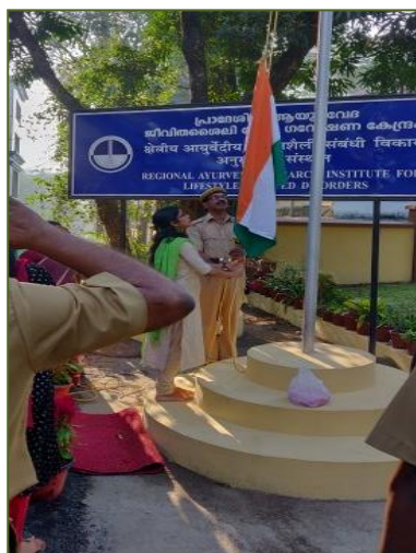
RARILSD, Thiruvananthapuram celebrated Republic Day by hoisting the National Flag in the presence of all the officials and staff.