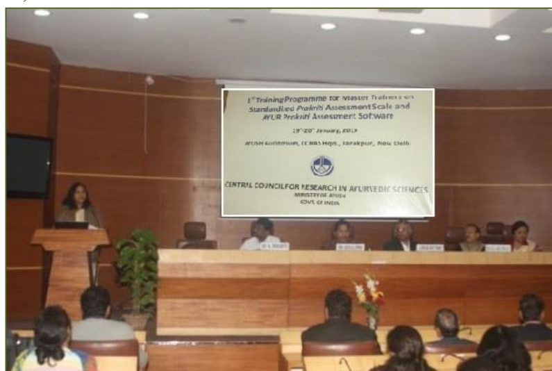
A view of inaugural session of Prakriti Training programme