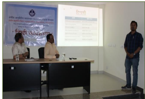
PowerPoint presentation on the topic entitled Noting in Hindi at RARIMD, Bengaluru