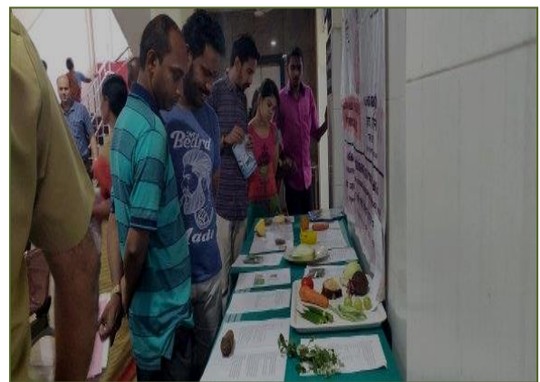
Exhibition on healthy diet organized as a part of “Poshan Pakhwada” by RARILSD, Thiruvananthapuram