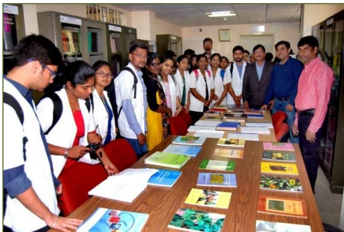
JSPS Govt. Homoeopathic Medical College, Hyderabad, students and Faculty viewing the Publications Books at NIIMH library

A team of Officers and officials from the institute participated in state level AROGYA FAIR at Necklace Road, Hyderabad (Telangana) from 15 th to 17 th February 2019, which was organized by PHD Chambers of Commerce and Industry. Institute's stall was inaugurated by Sh. Md. Mahmood Ali, Hon'ble Home Minister, Govt. of Telangana on 15 th February 2019. Institute conducted clinic and distributed free medicines, displayed exhibits, and sale of publications in the stall.