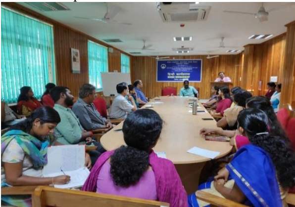
A View of Session organized on “ hindi ke likhit evam kathit roop ” at RARILSD, Thiruvananthapuram