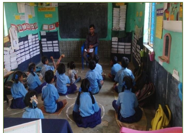
Awareness Programme for students about Dietetics and nutrition organised by RARIMD, Bengaluru