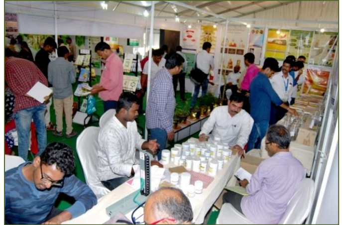
Hon'ble Home Minister, Govt. of Telangana, Md. Mahmood Ali, inaugurating the stall of NIIMH, Hyderabad (Right) Free distribution of medicines to the patients during Arogya Fair

A team of Officers and officials from the institute participated in state level AROGYA FAIR at Necklace Road, Hyderabad (Telangana) from 15 th to 17 th February 2019, which was organized by PHD Chambers of Commerce and Industry. Institute's stall was inaugurated by Sh. Md. Mahmood Ali, Hon'ble Home Minister, Govt. of Telangana on 15 th February 2019. Institute conducted clinic and distributed free medicines, displayed exhibits, and sale of publications in the stall.