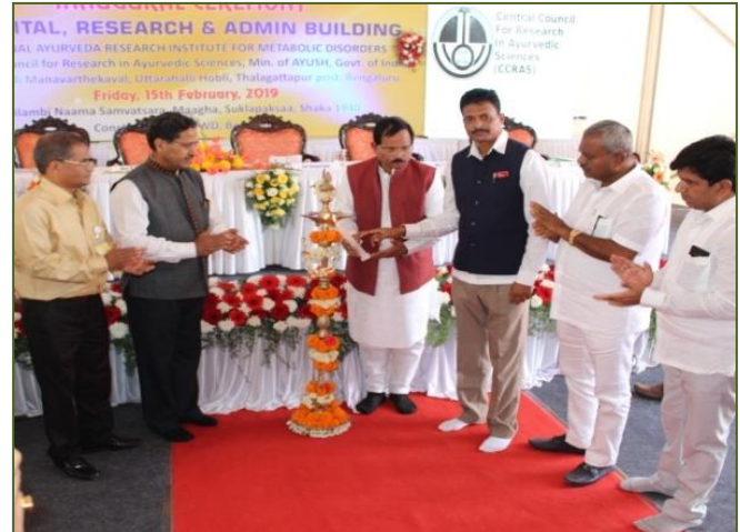
Inauguration of Hospital Block by Shri D V Sadananda Gowda, Hon'ble Minister for Statistics and Programme Implementation, Shri Shripad Yesso Naik, Hon'ble MoS (IC) MoA, Shri E. Tukaram, Hon'ble Minister for Medical Education, Govt. of Karnataka and other dignitaries at RARIMD, Bengaluru

Regional Ayurveda Research Institute for Metabolic Disorders, Bengaluru's new Hospital Block inaugurated by Shri D. V. Sadananda Gowda, Hon'ble Minister for Statistics and Programme Implementation, Shri Shripad Yesso Naik, Hon'ble Minister of State (IC) Ministry of AYUSH, Shri E. Tukaram, Hon'ble Minister for Medical Education, Govt. of Karnataka in the presence of Prof. Vaidya K. S. Dhiman, Director General, CCRAS and other dignitaries at RARIMD, Bengaluru.