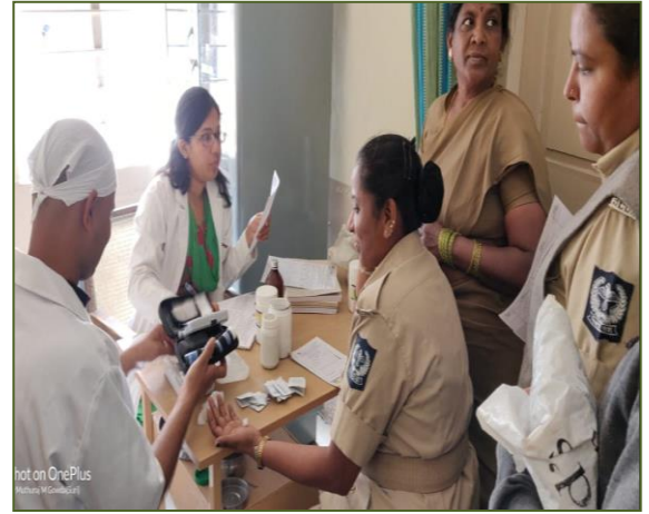
THCRP team members conducted free medical camp. (Right) Hemoglobin test conducted by SRP team for home guards at RARIMD, Bengaluru